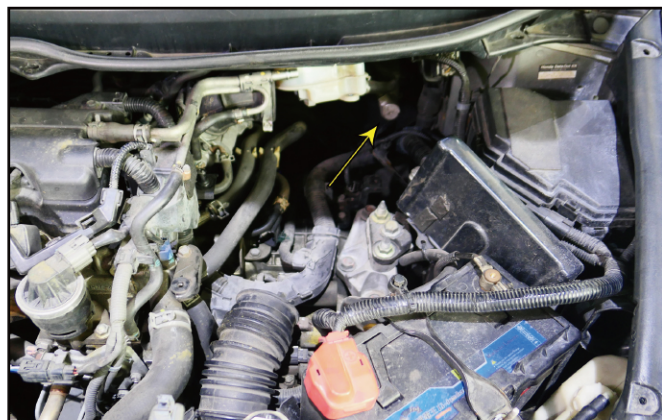
See figure 1 (參考圖表一)