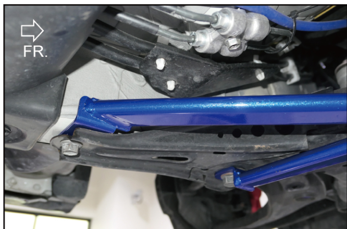
Illustration of installed state 安裝完成示意圖