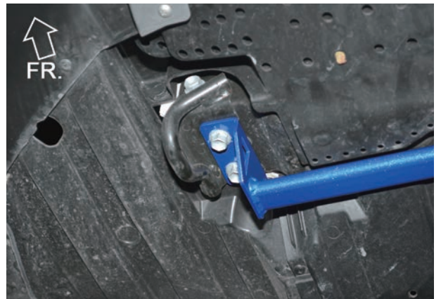
Illustration of installed state 完成示意圖