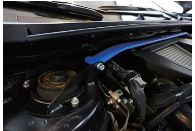
Illustration of installed state 完成示意圖